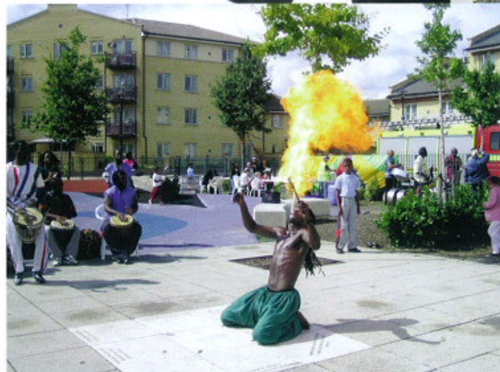
Flame throwing wowed the audience.